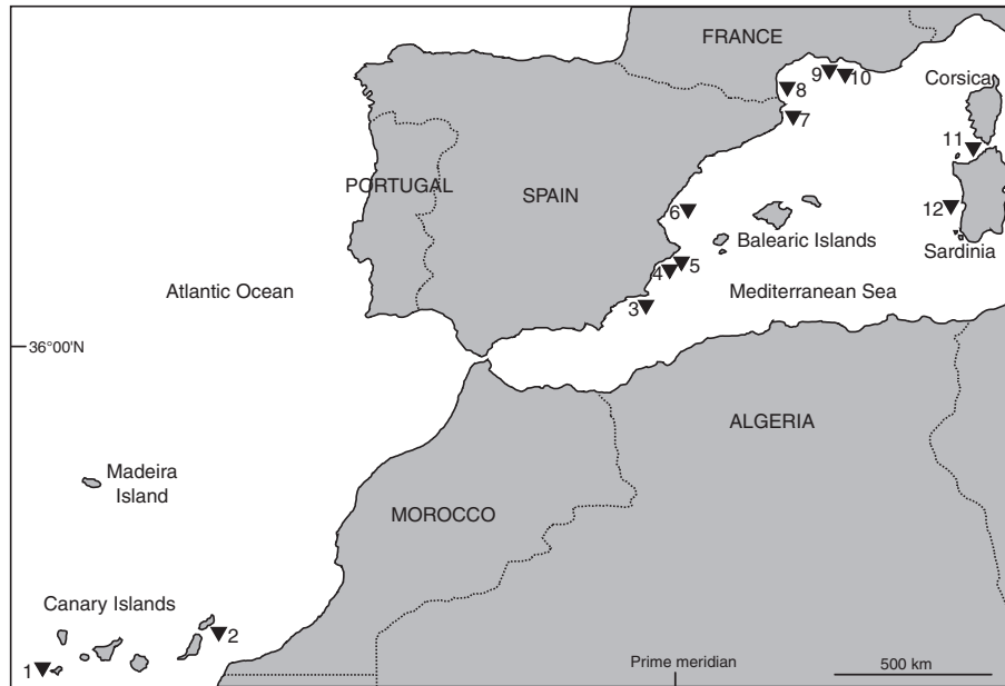
Figure 1 The location of the 12 European temperate marine reserves involved in the study.

densities per size group. Size groups were defined using 33 and 66 percentiles of the maximum size generally observed in the region. The commercial value of each fish species (see Appendix S1 in Supplementary Material) was assigned by three referees chosen among the researchers who worked on a marine reserve in which each given species was present. Referees scored each species as commercial, non-commercial or as species with low commercial value. Where consensus was not reached, the majority criterion was used. We defined the total density of commercial fishes by summing the density of all medium and large size classes of commercial species. For the analysis of density of commercial fish, we excluded the nine studies where sizes were not recorded. Species with low commercial value were excluded from the analyses. After this, 82 commercial species and 55 non-commercial species were retained.